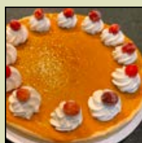
Pumpkin Bourbon Tart