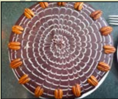
Chocolate Soufflé Cake