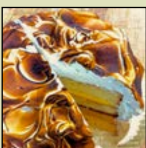
Lemon Meringue Cake